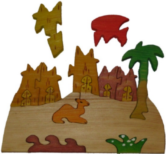
Figure H.1: The judge’s wooden puzzle.

During last year’s ACM ICPC World Finals in Marrakesh, one of the judges bought a pretty wooden puzzle depicting a camel and palm trees (see Figure H.1). Unlike traditional jigsaw puzzles, which are usually created by cutting up an existing rectangular picture, all the pieces of this puzzle have been cut and painted separately. As a result, adjacent pieces often do not share common picture elements or colors. Moreover, the resulting picture itself is irregularly shaped. Given these properties, the shape of individual pieces is often the only possible way to tell where each piece should be placed.