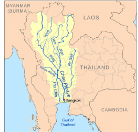
The Chao Phraya River System.

A simplified model of this river system is shown in Figure F.1, where the smaller red numbers indicate the lengths of various sections of each river. The point where two or more rivers meet as they flow downstream is called a confluence . Confluences are labeled with the larger black numbers. In this model, each river either ends at a confluence or flows into the sea, which is labeled with the special confluence number 0. When two or more rivers meet at a confluence (other than confluence 0), the resulting merged river takes the name of one of those rivers. For example, the Ping and the Wang meet at confluence 1 with the resulting merged river retaining the name Ping. With this naming, the Ping has length 658 km while the Wang is only 335 km. If instead the merged river had been named Wang, then the length of the Wang would be 688 km while the length of the Ping would be only 305 km.