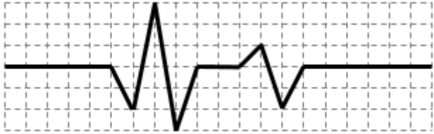
The cardiogram of a healthy patient. Length: 36.393.

The technique used by Dr. Zoidberg to adulterate a cardiogram consists of removing exactly K points from its polyline, where K depends on the seriousness of the patient. Of course, there could be several ways to do that, but the joke will be the best (in Zoidberg's opinion!) if the resulting plot is as short as possible in the sense that it becomes a good approximation to a straight line, that is, if it makes the patient believe he or she is close to death. To avoid suspicion, Dr. Zoidberg does not remove neither the first point nor the last point from the polyline.