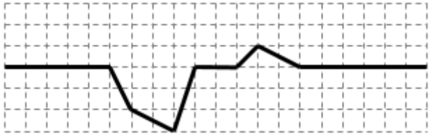
The cardiogram of a healthy patient. Length: 36.393.