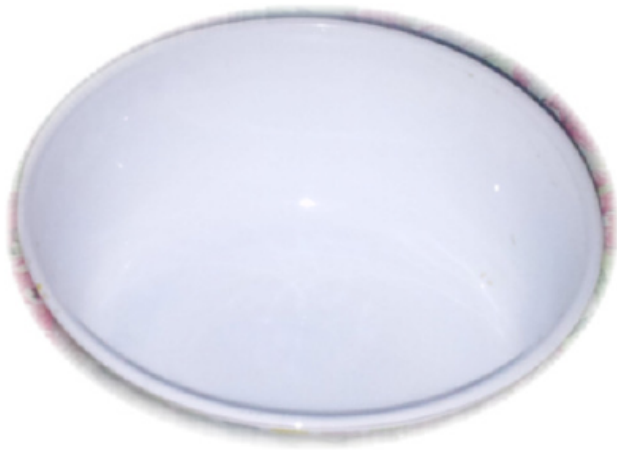
The empty bowl and the coin is not visible

We all know the common test of refraction of light with the visibility of a coin kept at the bottom of a bowl or cup. From a certain position the coin is not visible, but if we pour water into the bowl or cup it again becomes visible