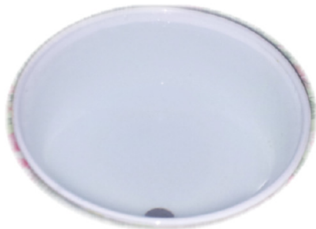
The bowl is filled with water and a part of the coin is visible